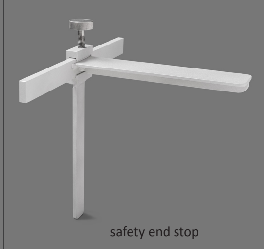
safety end stop