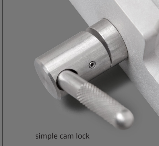
simple cam lock